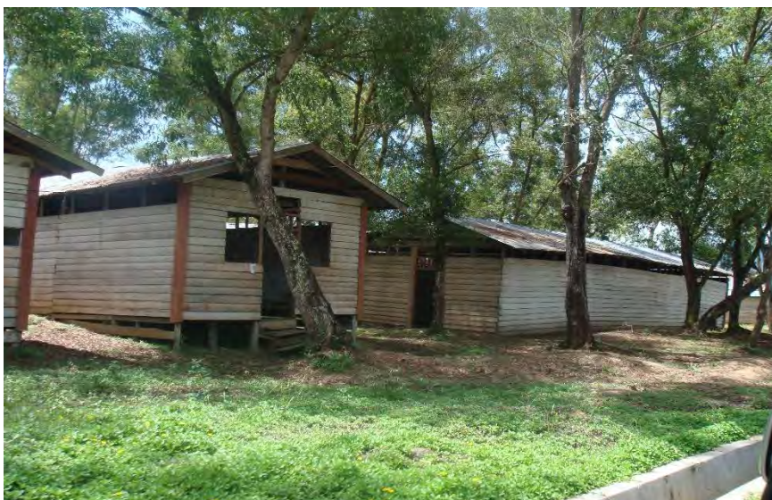
Sumber: Koleksi Penyelidik